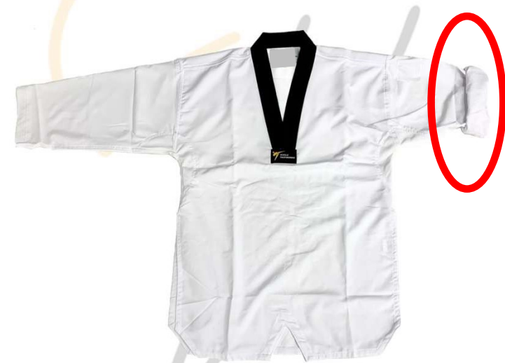
1. Rolling up the sleeve