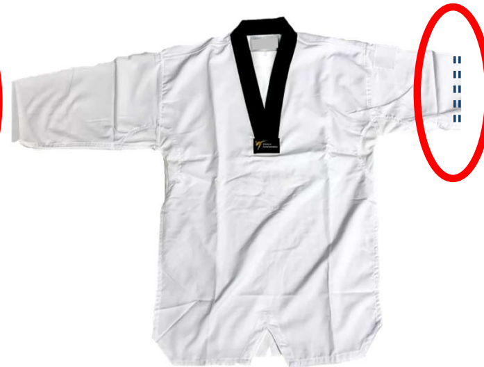
2. Stitching closed the sleeve openings*